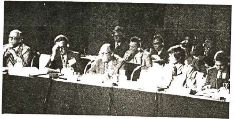
Delegates attending the Conference