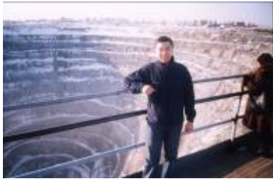
Diamond mine near Mirny

Sakha is a remote Russian region, five times the size of Texas, with strong business opportunities. The region is one of the world's leading producers of diamonds, and potentially one of Russia's leading producers of gold, oil and gas, accounting for 47% of Russia's coal reserves, and 35% of natural gas and oil in Eastern Siberia and the Russian Far East. The further development of coal mining, oil and gas, rough and cut diamond production, transportation, and timber processing complexes will open multiple investment, partnership, and trade opportunities for U.S. businesses.