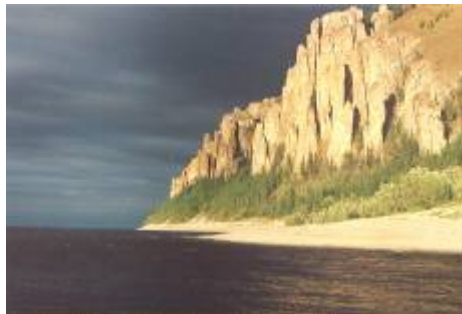
The Lena River and the rock formation called “The Lena pillars”

www.sakha.gov.ru www.yakutia.ru http://il-tumen.sakha.ru www.ykt.ru www.yakutiatoday.com http://yal.ru/ http://www.yakutia.org/ http://en.wikipedia.org/wiki/Sakha