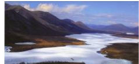
The Verkhoiansk Mountains