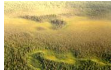
The taiga, or boreal forest