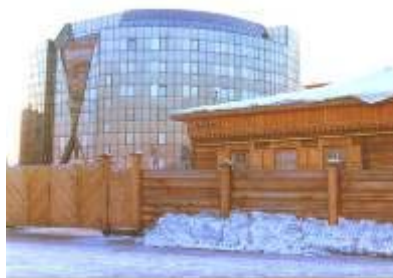
Yakutsk: the old and the new