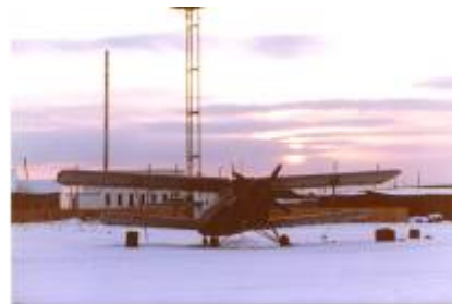
AN-2 commuter plane (Ilin-Avia)

http://www.sakhaexport.ru/page2.php?p=410